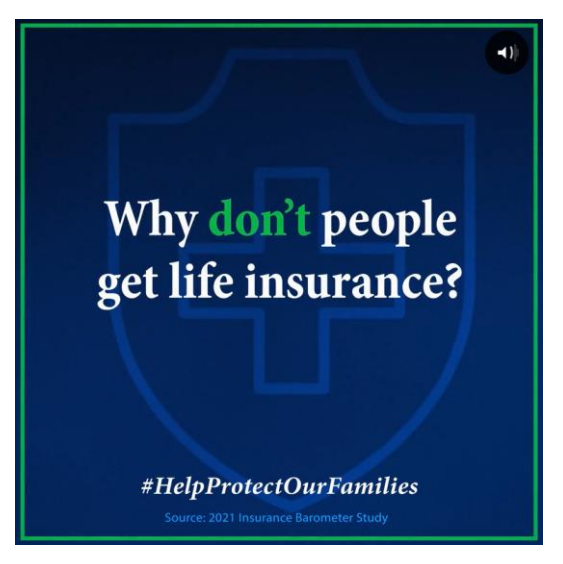
Click for animated social media post