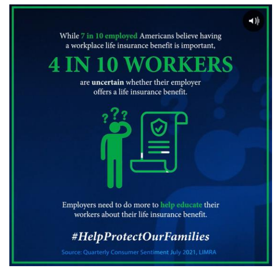
Click for animated social media post

We recommend you post these on your intranet, your corporate social media accounts, and/or ask your leaders to share them on their own accounts. Remember to use the hashtag #HelpProtectOurFamilies in your social media messages.