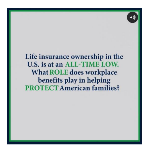
Click on image or visit: Workplace Life Insurance Benefits Offer an Easy and Affordable Way for Americans to Protect Their Loved Ones

According to recent LIMRA research, almost half of Americans (48%) are uninsured and many more are underinsured. In this week's video, three workplace benefits leaders talk about the important role workplace life insurance can play in protecting families' financial security.