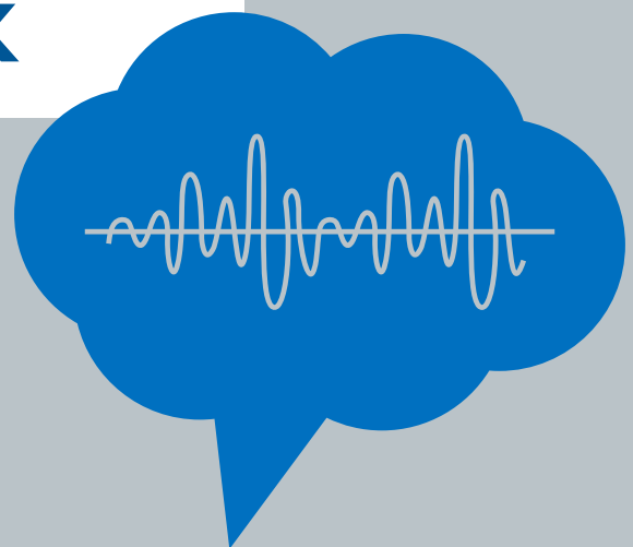
Figure out your voice and tone, and keep it consistent when you post.