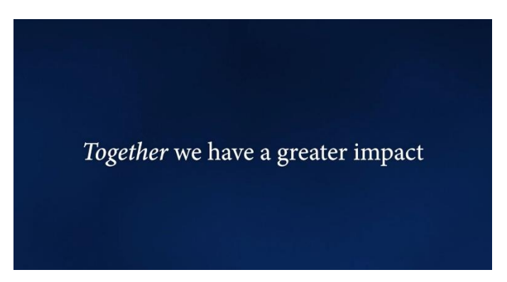
Together We Have A Greater Impact

Together we have shown we can make a greater impact that will ultimately help more families get the life insurance protection they need for their families.